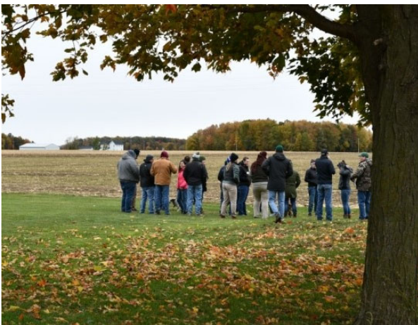
Agricultural and Agribusiness Institute “field days” like this one in 2022 in Clinton County are popular events where the research and outreach components come together to best help our farmers.