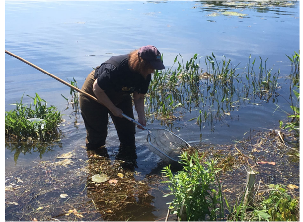
Michigan is home to more than 11,000 inland lakes and 36,000 miles of rivers and streams.

Introduction to Lakes is a six-week online course offered once a year and is designed for lake users, lakefront property owners, and lake managers. Participants increase their knowledge and understanding of lake ecology, watersheds, shorelines, Michigan water law, aquatic plants and community involvement. Inland lake management is complex and state agencies do not have the capacity to oversee the more than 11,000 inland lakes across Michigan. In 2022 we had our largest cohort of 524 participants. Participants from Michigan were spread out over 69 counties and included 49 local government officials. We also hosted three one-hour Ask-an-Expert webinars, allowing participants to interact with us and outside experts on topics covered in the course. Two hundred and seventy people attended the webinars live and 271 watched recordings.