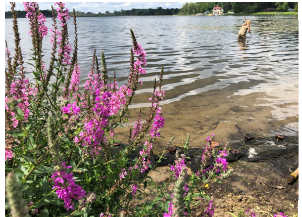
MSU Extension provides education to help county residents contain and not spread invasive species while enjoying the lake.

The Michigan Clean Boats Clean Waters program funded eleven aquatic invasive species education projects across the state in 2022. Awardees received between $1,000 - $3,000 for a total of $20,652.32. Funds were used to purchase invasive species decontamination equipment, educational signage at popular boat landings, and other aquatic invasive species prevention materials. Over 2,500 boaters were contacted at 80 events and an estimated 2,900 educational materials were distributed by grantees. MSU Extension has offered education at events like the 2022 summer solstice event at Park Lake in Clinton County (pictured opposite) to help county residents learn about their local lakes. Residents learn what is in the lake, good and bad, and are made aware of the importance of containing and not spreading invasive species.